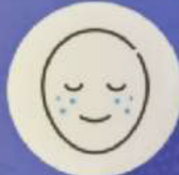
Freckle, Lentigines, Cafe-au-lait Spot, Becker's-Nevus, Age spot Improvement