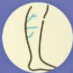
Vascular Vain Treatment