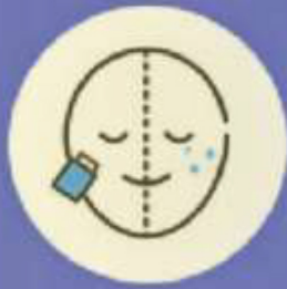
Melasma & PIH Improvement