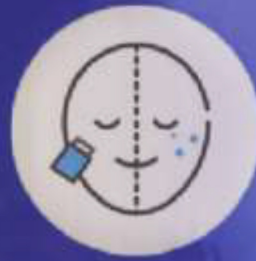
Nevus of Ota & ABNOM Removal